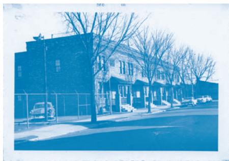
Penney Flats row house, 380-96 E. Becher Street, a rare form of housing in Bay View.

In 1901, Doepke constructed the first of what would eventually be seven modern buildings. Wrought Washer is the world's largest manufacturer of standard flat washers and special washers with this factory in Bay View and warehouses throughout the United States.