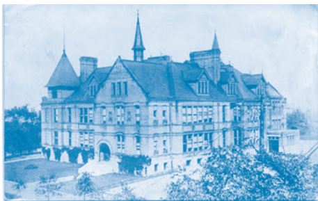
Mound Street School, 2148 S. Mound Street, now Winchester Village, 2147 S. Winchester Street.

The Queen Anne style 12th District School was built in 1897 between Mound Street and Winchester Street at 2148 South Mound Street. The school was later renamed Mound Street School. Mound Street got its name from the hill in this area that was leveled long ago; not from an Indian Mound as many have claimed. The school closed in 1979 and was converted in 1983 to the senior housing Winchester Village, addressed at 2147 South Winchester.