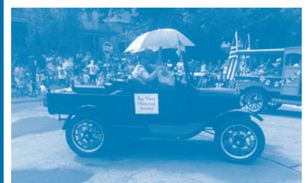
Members of the Milwaukee Model T Ford Club represented the Bay View Historical Society at the Humboldt Park Forth of July Parade with four of their antique vehicles.

Proceeds from this event will support preservation of the historic Beulah Brinton House