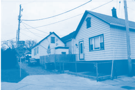
The brick street and lone home on Brunks Lane.

(named Zillman Park in 1978). Today there is one house on Brunks Lane which is the only brick street in Bay View.